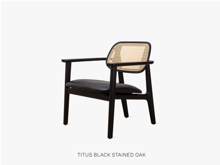
TITUS BLACK STAINED OAK