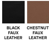
BLACK FAUX LEATHER CHESTNUT FAUX LEATHER