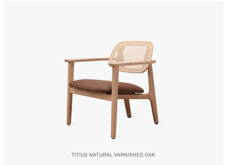
TITUS NATURAL VARNISHED OAK